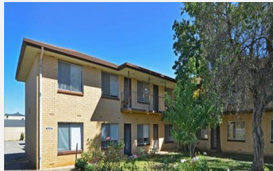
UNIT IN KLEMZIG. Walk to the OBahn!

qualified advice is invaluable. Call us now for help.